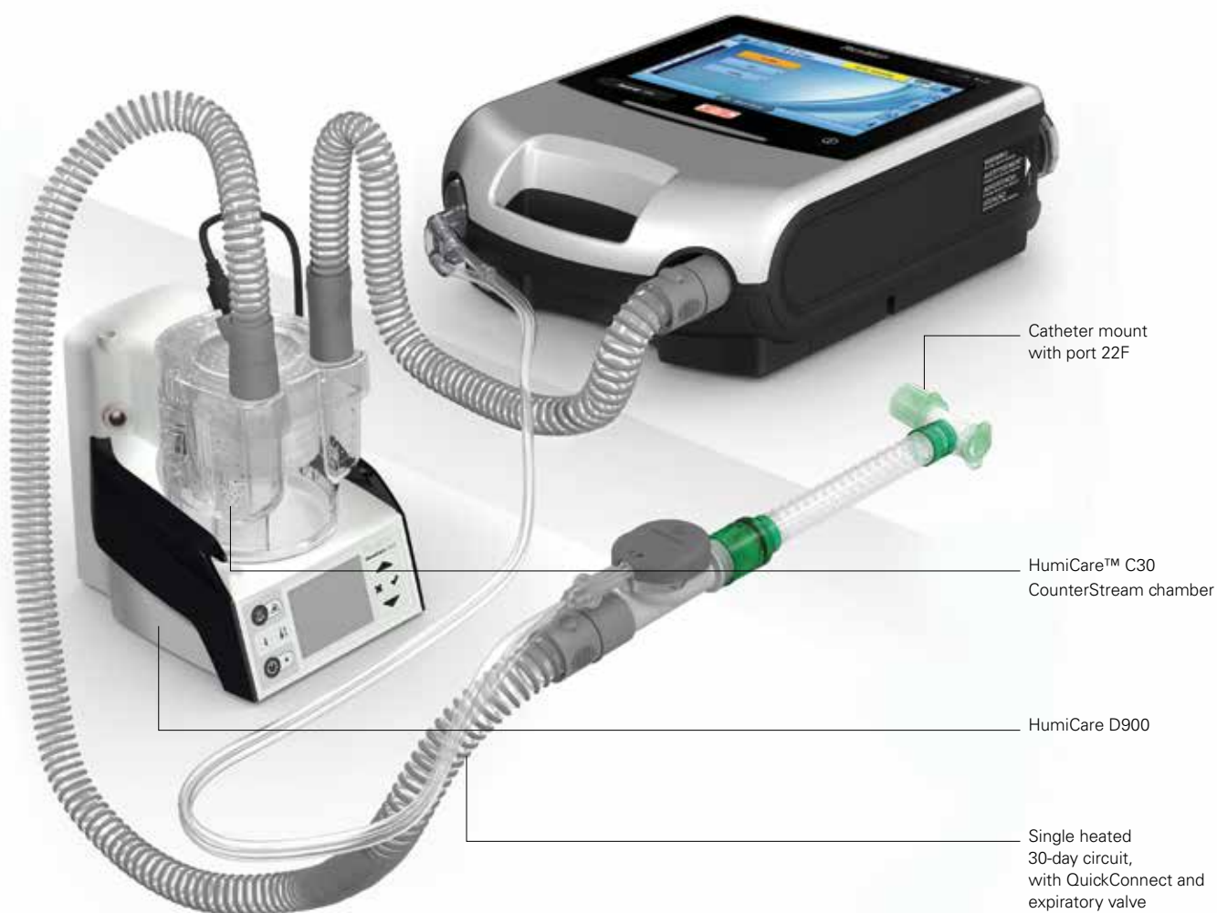
Catheter mount with port 22F