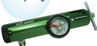
VST-307/ VST-308/ VST-309

2 DISS Model for Ventilator Regular - CGA 870 Body Length: 13 cm