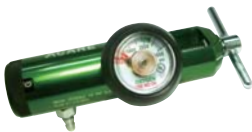
VST-305/ VST-304/ VST-306