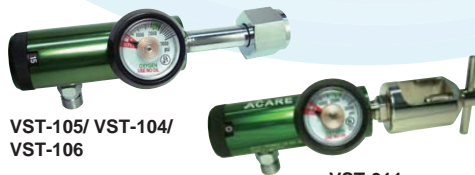
VST-105/ VST-104/ VST-106