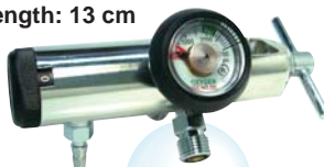
VST-312 (All Brass body, 0-25 lpm) VST-314 (All Brass body, 0-15 lpm)

2 DISS Model for Ventilator Regular - CGA 870 Body Length: 13 cm