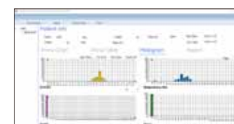
Data Review - Histogram