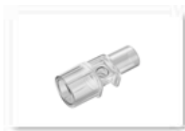
Adult/Pediatric Airway Adapter