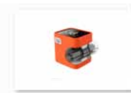
Silicon Rubber Cover