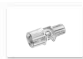
Neonate Airway Adapter