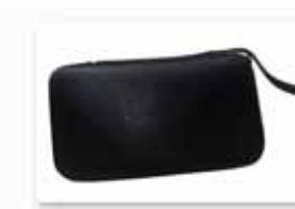
Capno Cube Kit