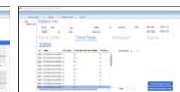
Data Review - Trend Table