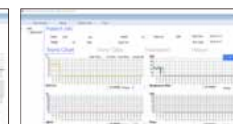
Data Review - Trend Chart